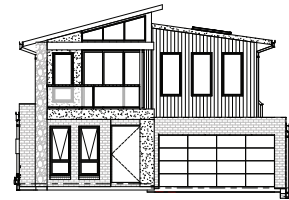
MID CENTURY FACADE - ON DISPLAY

Available Sizes: 33, 36, 36 narrow, 38, 42 Fully Customisable Floorplans