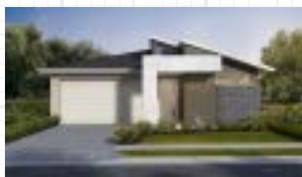
Austinmer (on display)